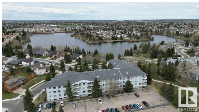
101-15503 106 St, Edmonton, AB